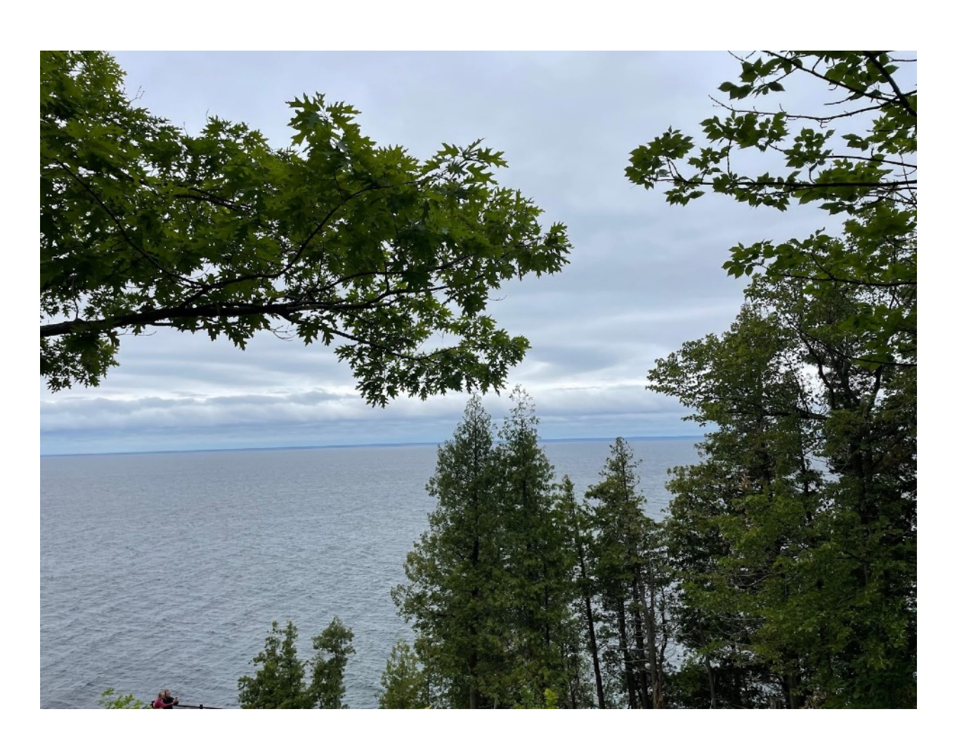
Day 4: Thursday June 6, 2024, 54 miles, +1889 ft.

Day 3 we will leave Sturgeon Bay and continue north on the east coastline to Bailey's Harbor, North Bay, west across the peninsula to Ephraim. From Ephraim, we will proceed to Peninsula State Park and ride the perimeter of the Park including 8 miles of shoreline. We will end in the town of Fish Creek and stay at Julies Café Motel. We will be in Fish Creek for 2 nights. <a href="https://www.Julesmotel.com">https://www.Julesmotel.com</a>