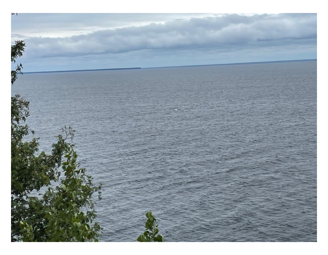
Day 5: Friday June 7, 2024, 44.9 miles, +1277 ft.

We leave Fish Creek and head south to Egg Harbor. We continue south along the coastline and return to Sturgeon Bay with a side trip out to Potawatomi State Park. Lodging is at Stone Harbor Inn.