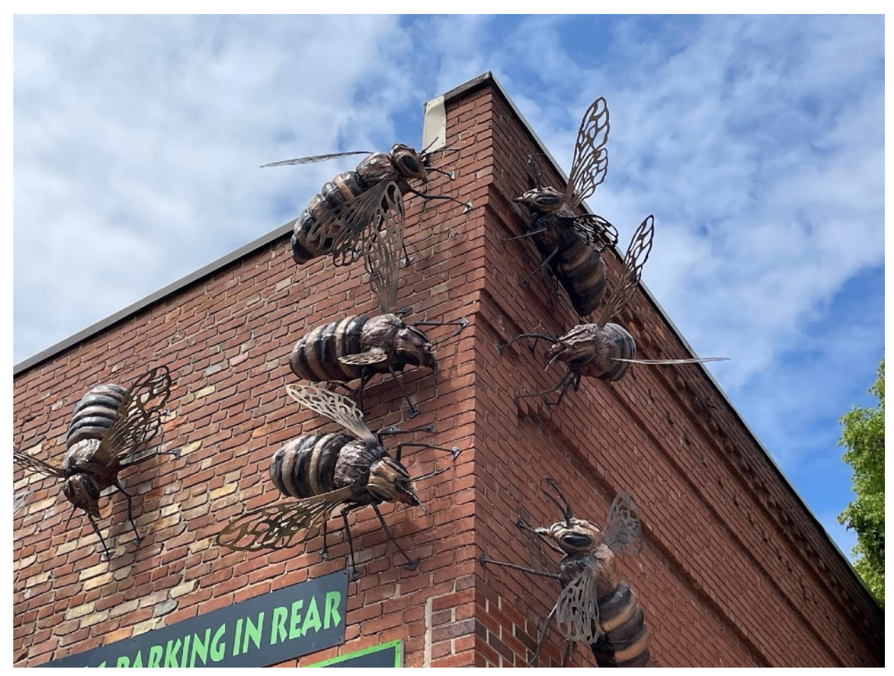
A cute building in De Pere